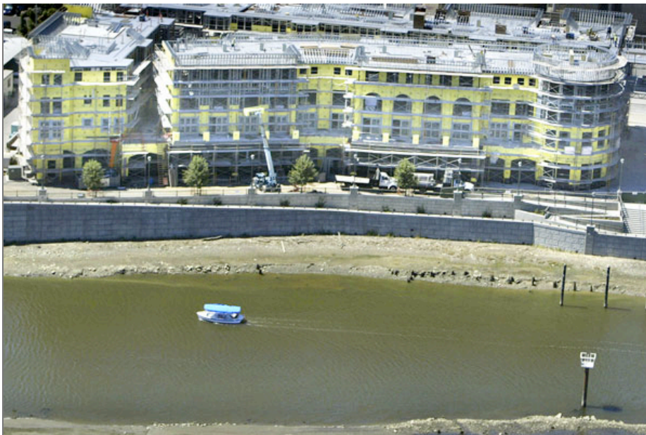
The Riverfront has sold the first 10 condominiums in the project. 50 condos are planned, ranging in price from the high $600,000s to $1.67 million. The project is scheduled for an early 2009 completion.